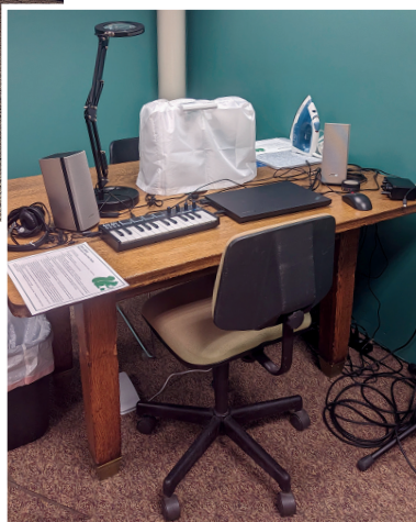
Alesis V-Mini - 25-Key USB MIDI Keyboard Controller with 4 Backlit Sensitive Pads, 4 Assignable Encoders and Professional Software Suite Included