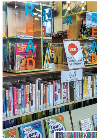
Small Book Display Carrels