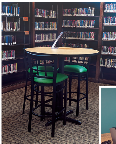
Café Tables and Chairs for Group Work Area