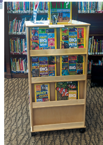
Large Book Display Carrels