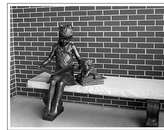
The statue "Puppy Dog Tales" by artist Bobbie Carlyle welcomes visitors to Oakmont Library